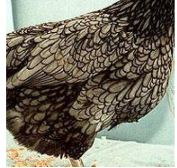
Ameraucana Andalusian

This large fowl blue is the correct shade of blue, but where is the lacing the standard calls for as the Andalusian hen below demonstrates?